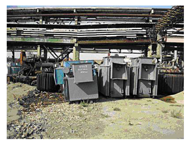
Figure 1. The oiled power transformer

cording to the Russian classification. Also it is well known that capacitor banks are the kind of garbage, referred to the second class of danger, due to containing of heavy metals, alkali and acids, which are danger for human and environment.